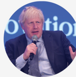
• Boris Johnson

The 54th Speaker of the United States House of Representative