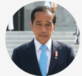
• Joko Widodo