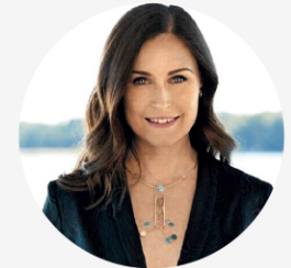
• Sanna Marin