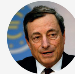
• Mario Draghi

Former Prime Minister of the United Kingdom