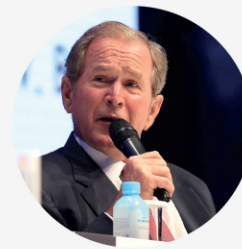
• George W. Bush