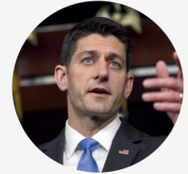
• Paul Ryan

The 54th Speaker of the United States House of Representative