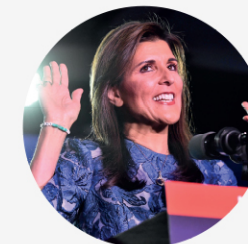
• Nikki Haley

Former Speaker of the House of Representatives of Japan