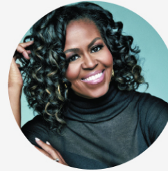
• Michelle Obama