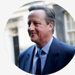
• David Cameron

Former Prime Minister of the United Kingdom