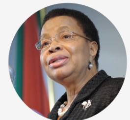
• Graça Machel

The 29th United States Ambassador to the United Nations