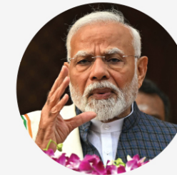
• Narendra Modi

Former Prime Minister of the United Kingdom