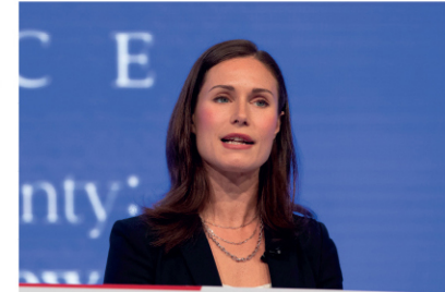
ASIAN LEADERSHIP CONFERENCE The Era of Hyper-Uncertainty Innovative Leadership for