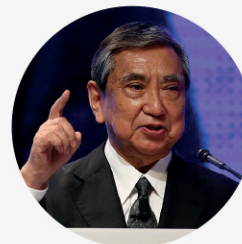
• Yohei Kono

Former Speaker of the House of Representatives of Japan